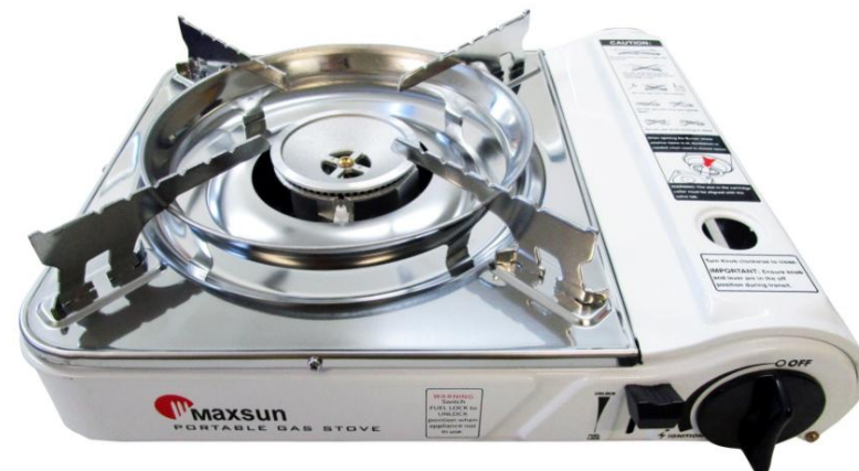
Stainless Steel Portable Gas Stove (White / item no. 8888)