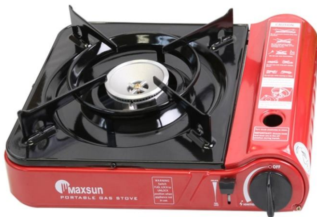
Portable Gas Stove (Red / item no. 8887)